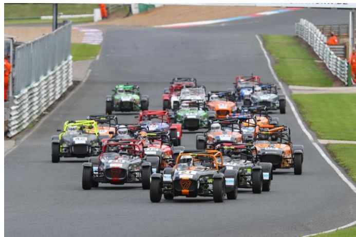
A large grid of Caterhams off the line in Mallory Park and into the long Gerards Bend

There is a large number of entries and so that all drivers can get two races there will be three races with each class having two races.