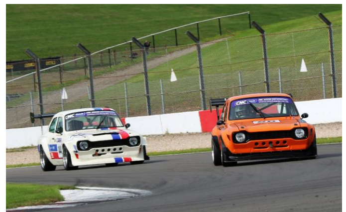
Piers Grange and Tim Foxlow in their beautiful Escorts

The classes are divided by engine size with A and D above 2500cc, B and E 1600cc to 2500cc and C and F up to 1600cc.