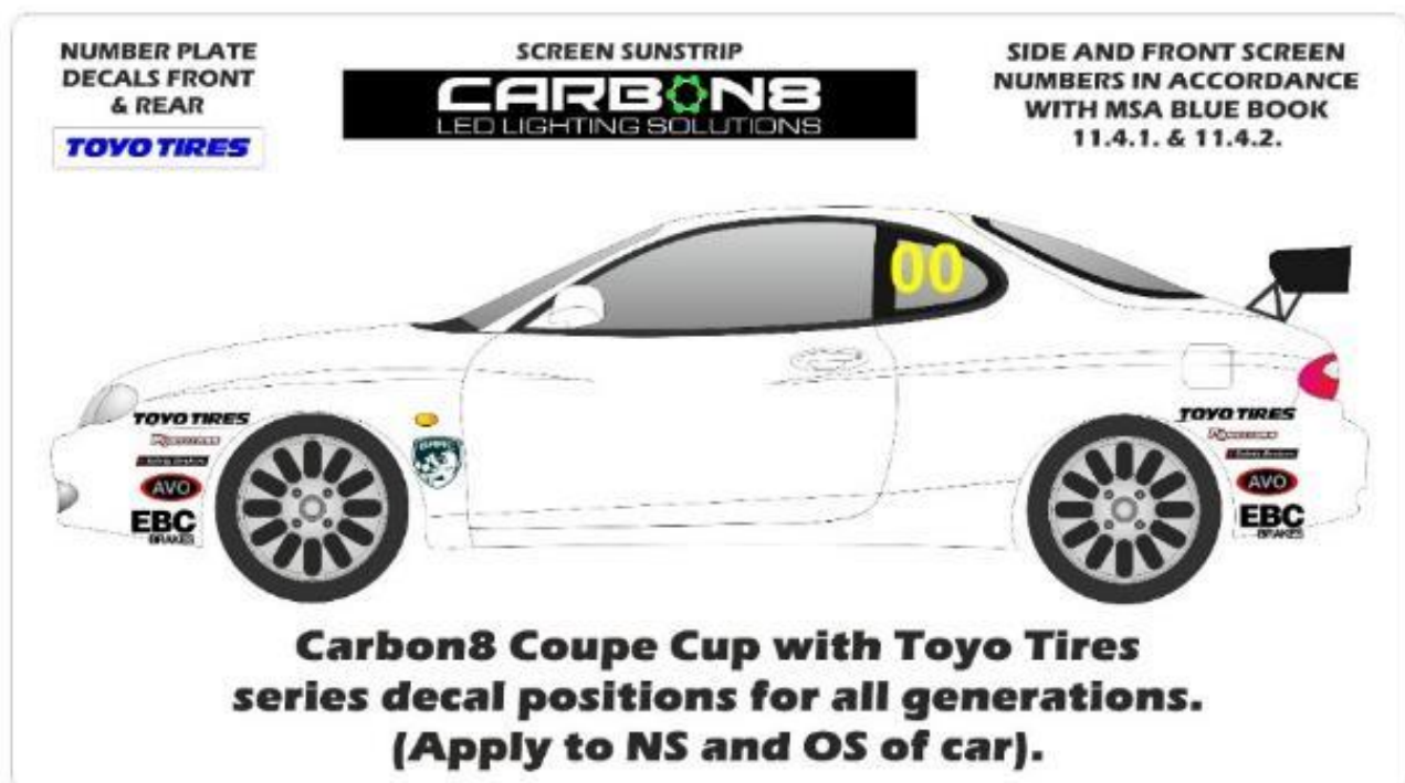
Figure 1: Series Approved Decal Positions

5.21.1 Having due regard to the best interests of the series sponsors, the series image, BARC and of safety, competing cars are to be presented in a mechanically and visually acceptable condition. Organisers reserve the right to insist that such standards of presentation are maintained, as a condition of racing within the Carbon8 Coupe Cup with Toyo Tires. Individual cars may fail scrutineering if as deemed by the scrutineers or series organisers to be of poor presentation and / or mechanically unacceptable.