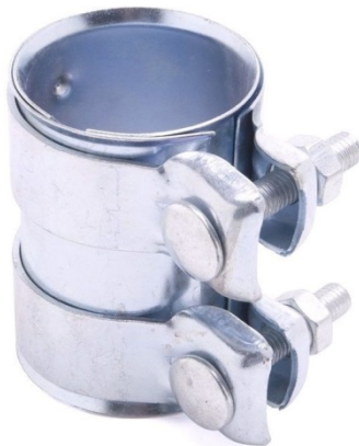
Universal Exhaust Pipe Sleeve Clamp

The overall length of the exhaust centre pipe must not be altered. You may either use a Universal Exhaust Pipe Sleeve Clamp as shown below or make a slip joint.