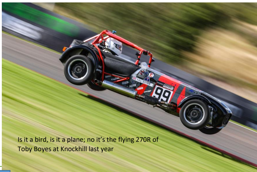
Is it a bird, is it a plane; no it's the flying 270R of Toby Boyes at Knockhill last year