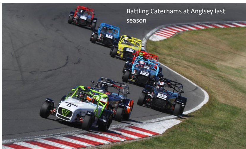
Battling Caterhams at Anglesey last season

Following directly on in races 2, 6 and 10 are the 270R's new big brothers the Motul Caterham Seven 310Rs. With 152 BHP on tap they are not for the faint hearted but give regular Caterham racers a chance to take a step up in power.