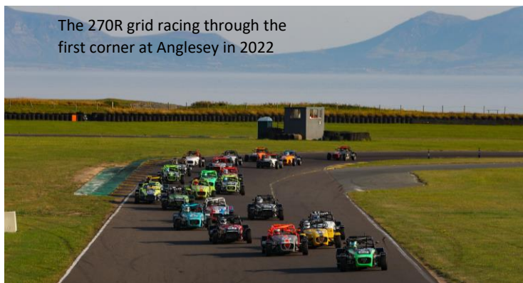
The 270R grid racing through the first corner at Anglesey in 2022

Visibly different to the roadsports, the cars of the Mission Motorsport Caterham Seven 270R Championship, races 1, 5 and 9, have had their weight, aerodynamics and handling improved by the removal of their windscreens and lights and the stiffening up of their suspension. Moving them away from their road car origins and turning them into purposeful racing cars. The championship also removes the restrictions on who runs the cars and drivers benefit from the experience and guidance of professional teams.