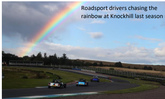
Roadsport drivers chasing the rainbow at Knockhill last season

Welcome to BARC NW's first meeting of the year. Yes, it's finally here, the spring and the new racing season. The fence still isn't painted, the garage is still full of junk and those new Ikea shelves are still in the cardboard they arrived in, but who cares? Racing is back!