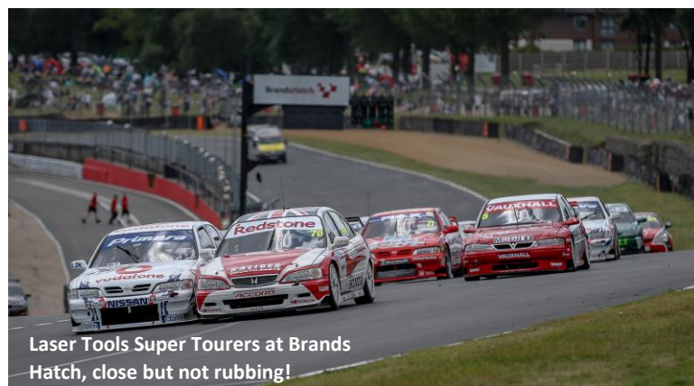
Laser Tools Super Tourers at Brands Hatch, close but not rubbing!

The Laser Tools Super Tourers series comes to Croft on the back of last month's fantastic Super Touring Power festival at Brands Hatch. While it's fair to say the entry here won't quite match the one in Kent (how could it?!), we will still see a wonderful reminder of arguably the best-loved era of the British Touring Car Championship.