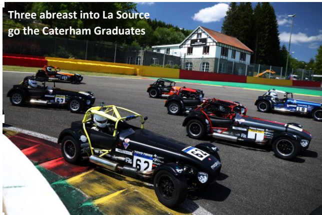
Three abreast into La Source go the Caterham Graduates