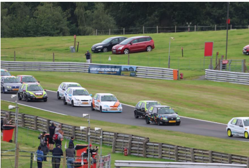
Close combat amongst the Saxo's earlier this season at Oulton Park

We look forward to seeing who makes it onto pole position this weekend and who gets to take the win and the rookie win home from Croft.